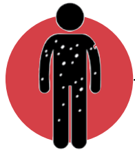
RED HOT SKIN