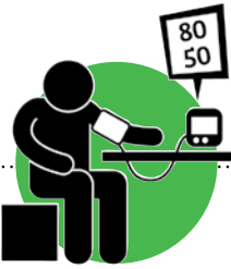
LOW BLOOD PRESSURE